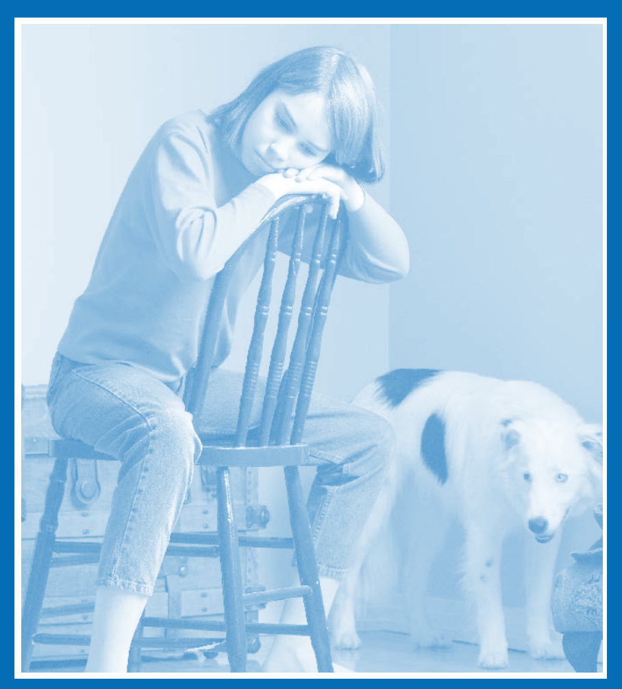
A Resource Book for Albertans January 2011

The Relationships between Animal Cruelty, Child Abuse and Domestic Violence